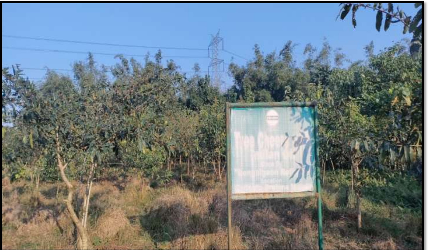
4810 nos of sapling Planted in the month of August'2020 at Hatipota Brahma Mandir, Growth as on October,2023.