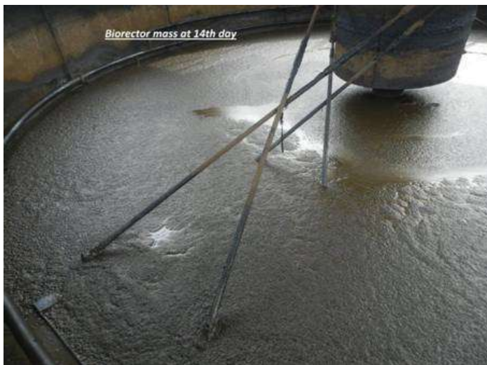
Bio-remediation facility of BGR

Further two more Rain Water Harvesting (Ground Water Recharging) schemes in BS-VI project have been implemented during 2019-20 and Two more implemented in the FY 2020-21 in Admn. Building and inside BGR Township temple complex.